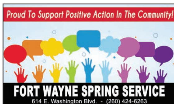
Shown smaller than actual size

$65 per issue (6 month commitment / 13 issues per half year)